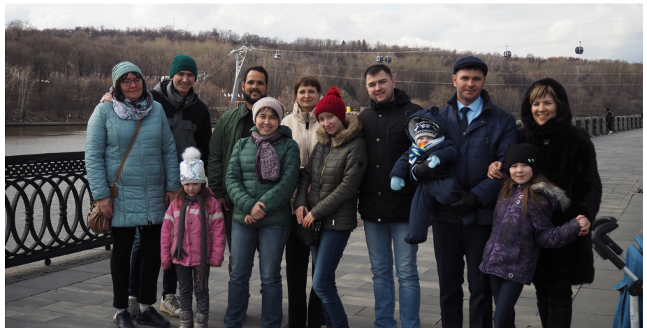
Exploration Weekend 2020

When I returned to Moscow in March 2020 after a trip to the United States, it felt as if I had left from one planet and returned to another less than a month later. I am thankful to all the students, trustees, advisors, friends, faculty and staff of the Moscow Seminary for making this “interplanetary” coronavirus quarantine jump with us.